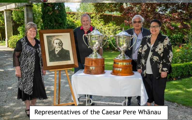
Representatives of the Caesar Pere Whānau