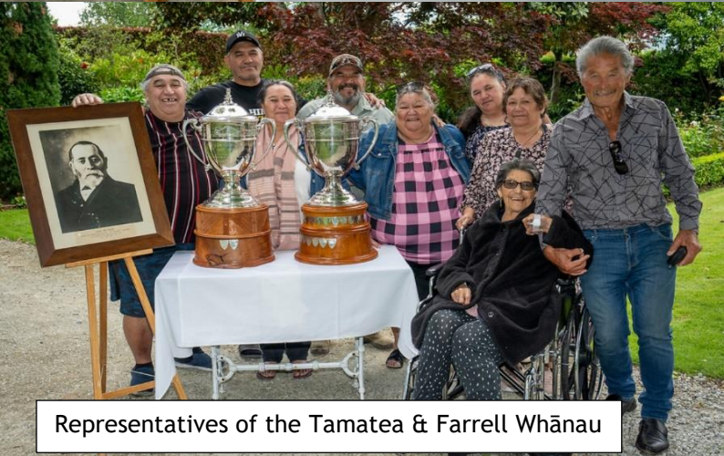
Representatives of the Tamatea & Farrell Whānau