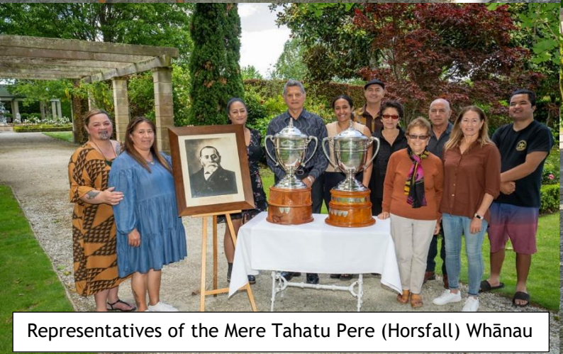
Representatives of the Mere Tahatu Pere (Horsfall) Whānau