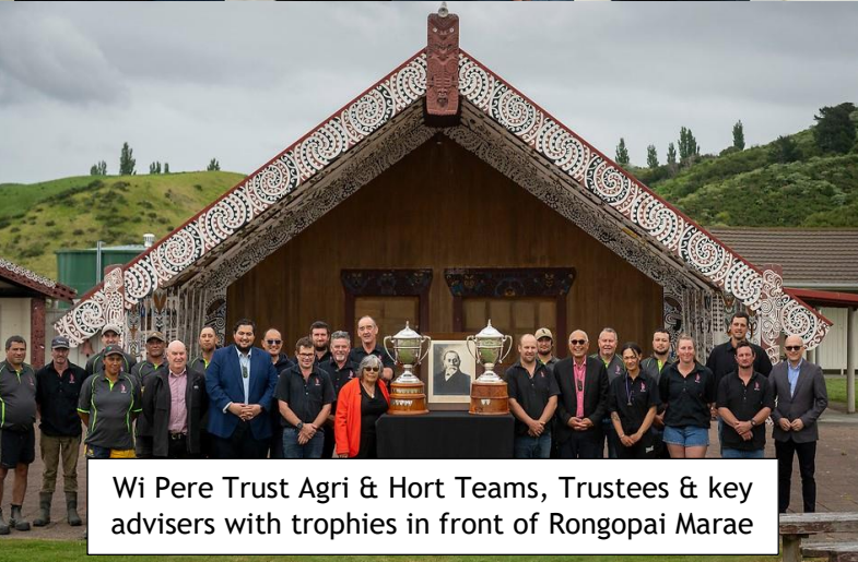
Wi Pere Trust Agri & Hort Teams, Trustees & key advisers with trophies in front of Rongopai Marae