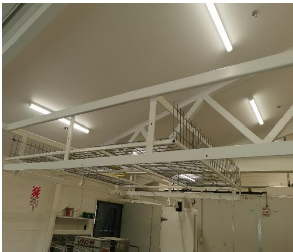
Lighting in the cooper room