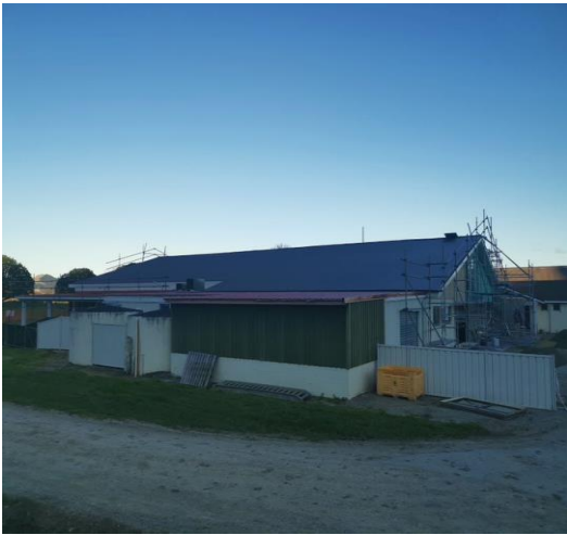
Side view of new roof on Wharekai