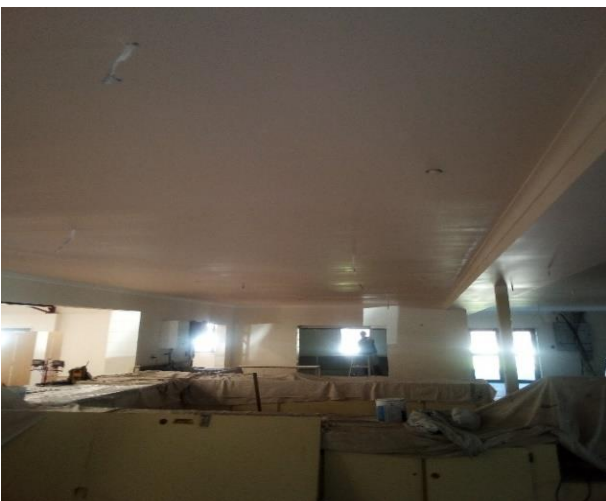
Interior of kitchen