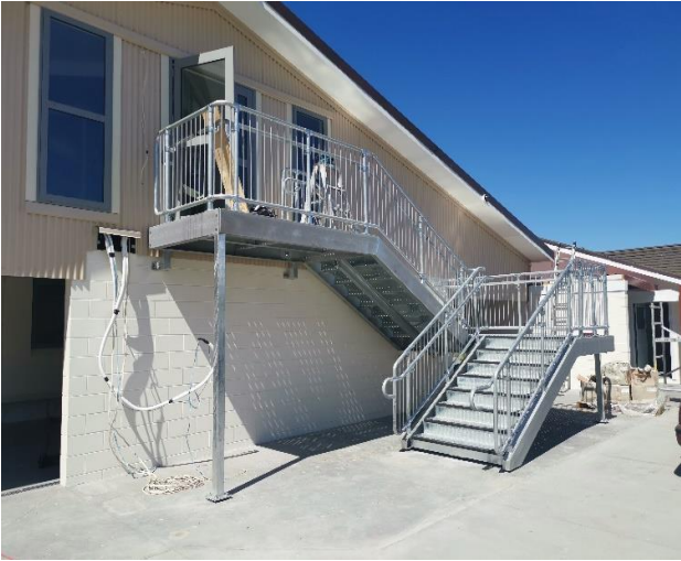
Completed stairs leading to the Mezzanine