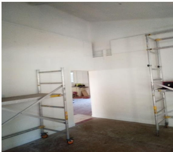
Painting in the interior of kitchen