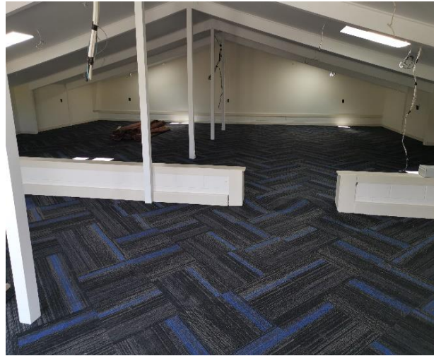
Upgraded Mezzanine and now fire compliant