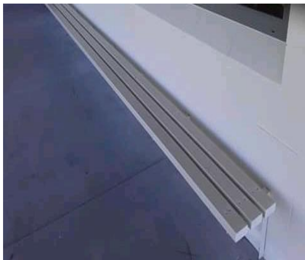
Time to take a break, all areas around the Marae have had a fresh coat of paint. Painters have kept as near as they could to the original colour of the Marae