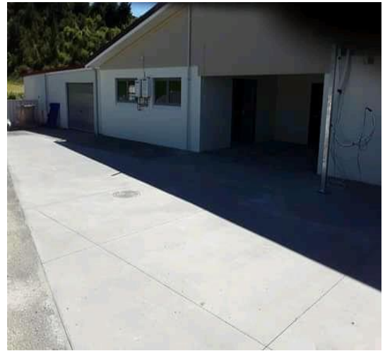
Extended concrete at the back and underground pipes