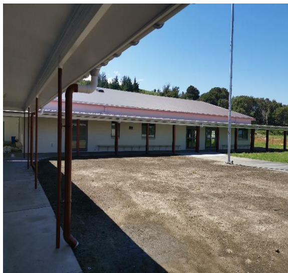
Downpipes, spouting, gully traps, new roof on Wharekai