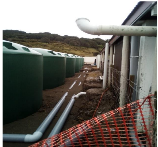
Six newly installed tanks, now connected all pipes are now underground