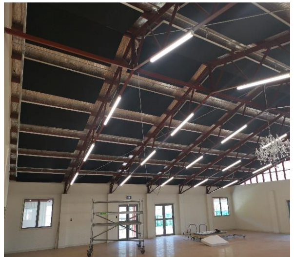
Inside the Wharekai, with new lighting installed