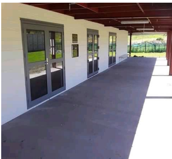
New doors and windows, reinforced concrete foot path