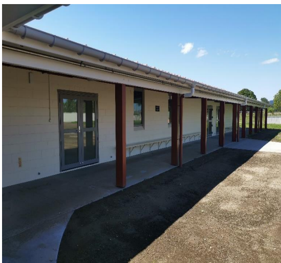
Side view of Wharekai