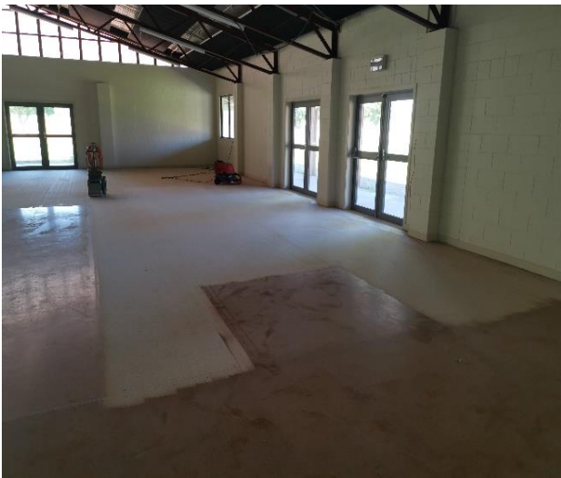
Sanding the Wharekai and polishing floors - work still in progress