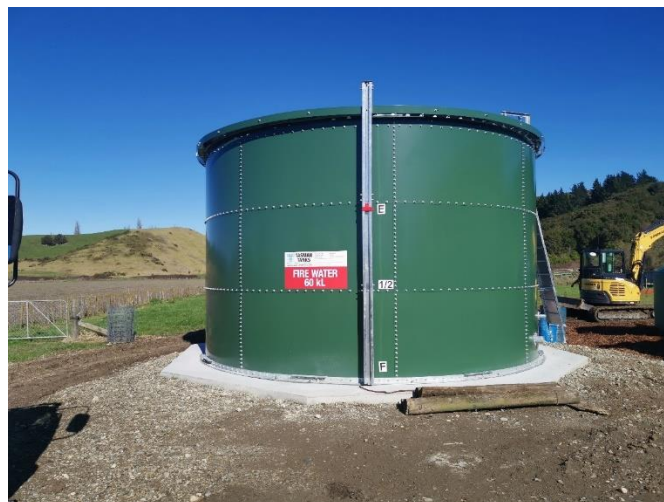
The new Fire tank of which the Wharenui, Wharepaku and Wharekai are now all connected with through the new fire sprinkler system. We are now fire compliant, including the couplings on the exterior.